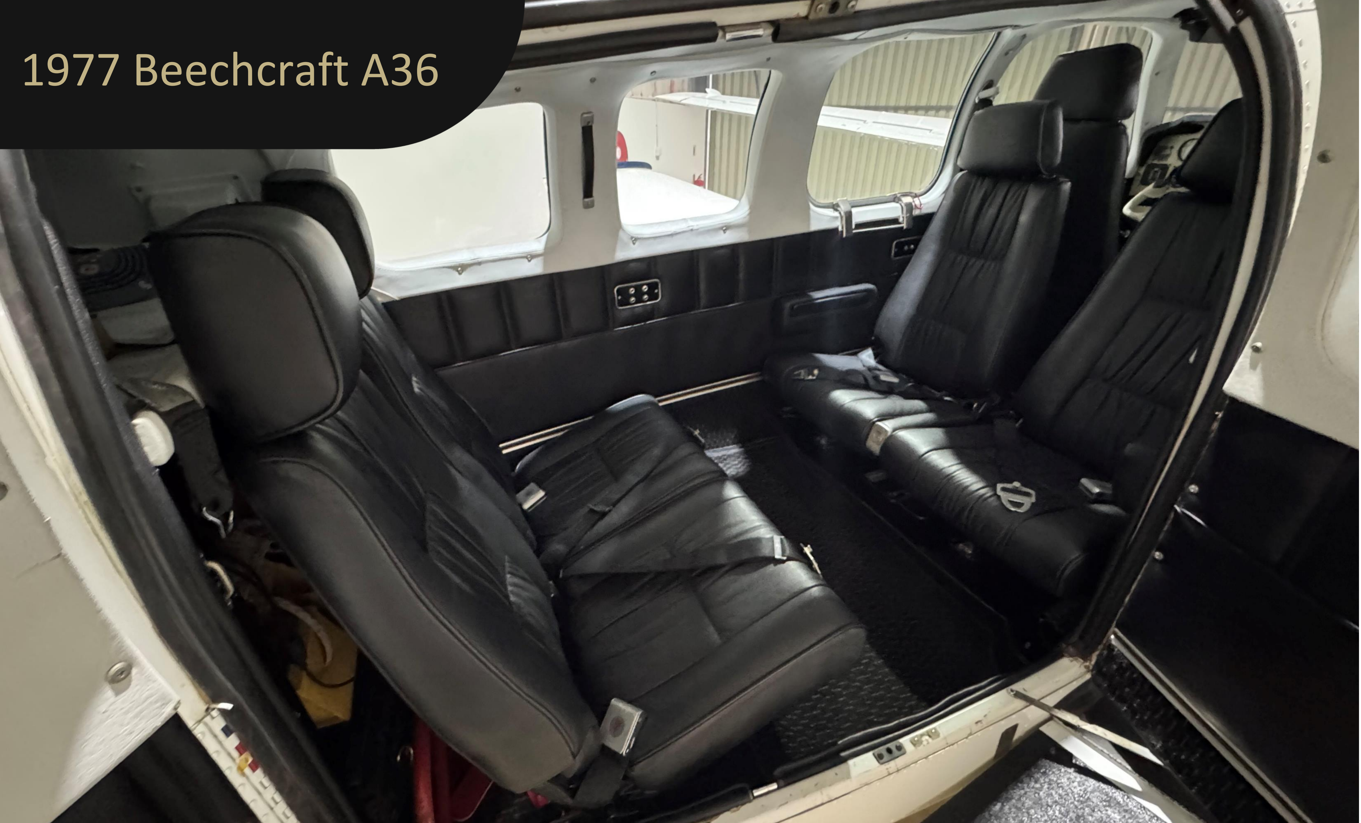
1977 Beechcraft A36